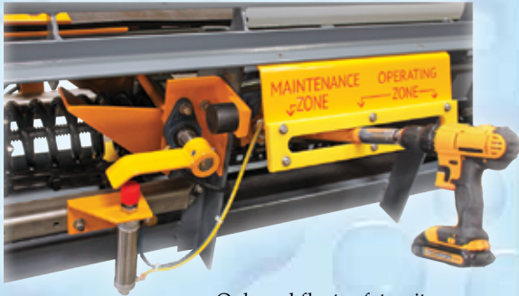
Onboard float safety pit water level detection.