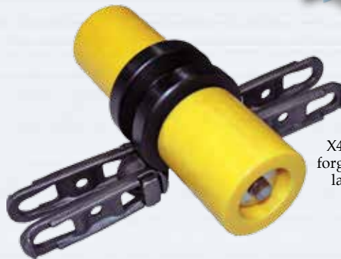
X458 Chain. Self-locking drop forged, the strongest and longest lasting chain in the industry

No pneumatic cylinder used to maintain chain tension.