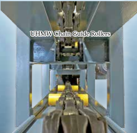
UHMW Chain Guide Rollers